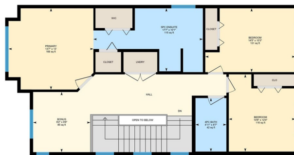
0 4 8 ft PREPARED: Jul 2021 White regions are excluded from total floor area in GUIDE floor plans. All room dimensions and floor areas must be considered approximate and are subject to independent verification.

2nd Floor Total Exterior Area 1074.00 sq ft Total Interior Area 998.28 sq ft