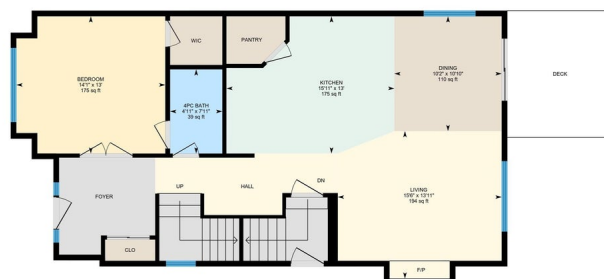
0 4 8 ft PREPARED: Jul 2021 White regions are excluded from total floor area in GUIDE floor plans. All room dimensions and floor areas must be considered approximate and are subject to independent verification.

Main Floor Total Exterior Area 1099.21 sq ft Total Interior Area 1021.39 sq ft